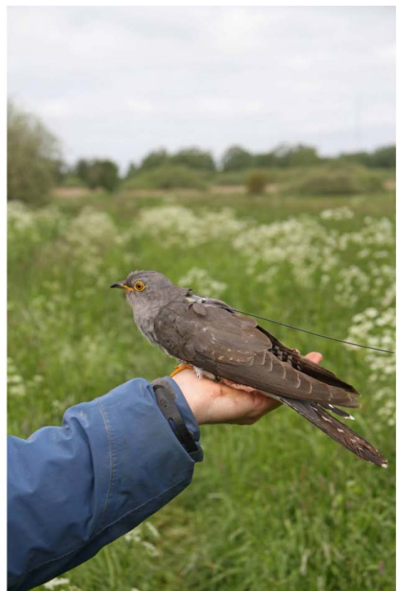
Common cuckoo with satellite tag.

One of the key issues in conservation today is how you measure the success of any initiative, or management plan, or reserved area, or piece of legislation. Clearly we can't do conservation with the proper controls (or counterfactuals to use the buzzword) – we won't be advising setting up a network of reserves in one flyway and not another so we can demonstrate that reserve networks are an effective conservation strategy. We have to rely on "natural" variation in the application of conservation measures that vary within and between countries at all scales. However, on a flyway level, we can't even do this. Nothing that is done in one area is independent from another because the animals we seek to conserve move over continental scales. And this is made worse by the fact that our realistic capacity for success is decreasing every day. If there are 7 billion people on the planet then clearly there cannot be as many other animals, and as this human population increases so there can only be less space and energy available for other species. So we cannot ever hope to restore populations to arbitrary levels set when conservationists started properly counting a few decades